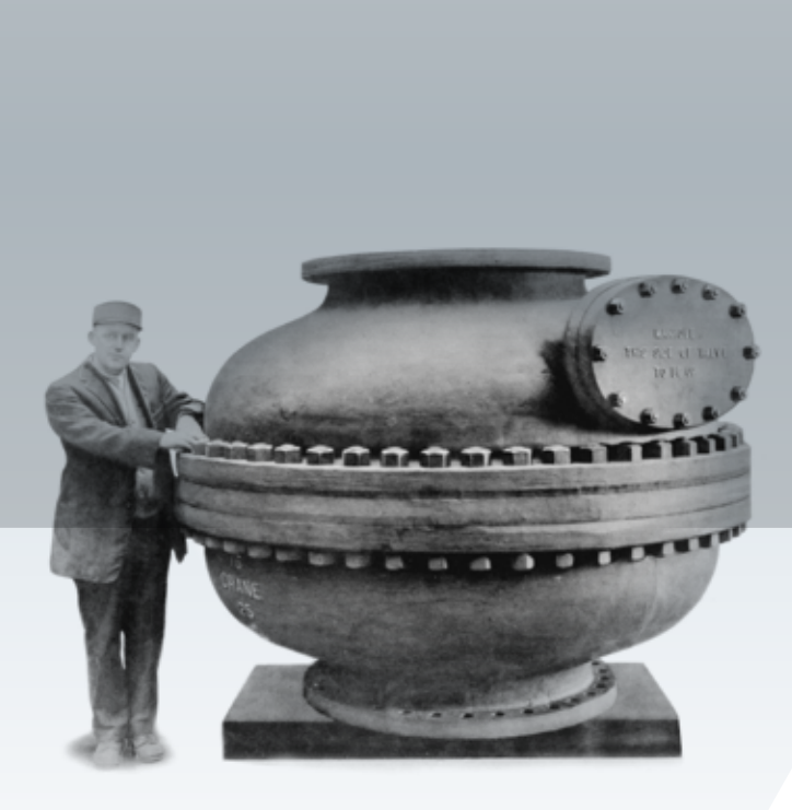
Crane ChemPharma & Energy

The concept of corporate responsibility—where companies take responsibility not only for profits but also for the impact of their activities on the many different stakeholders with which it interacts—is the foundation on which the company was built and the common thread that ties together all the company does today.